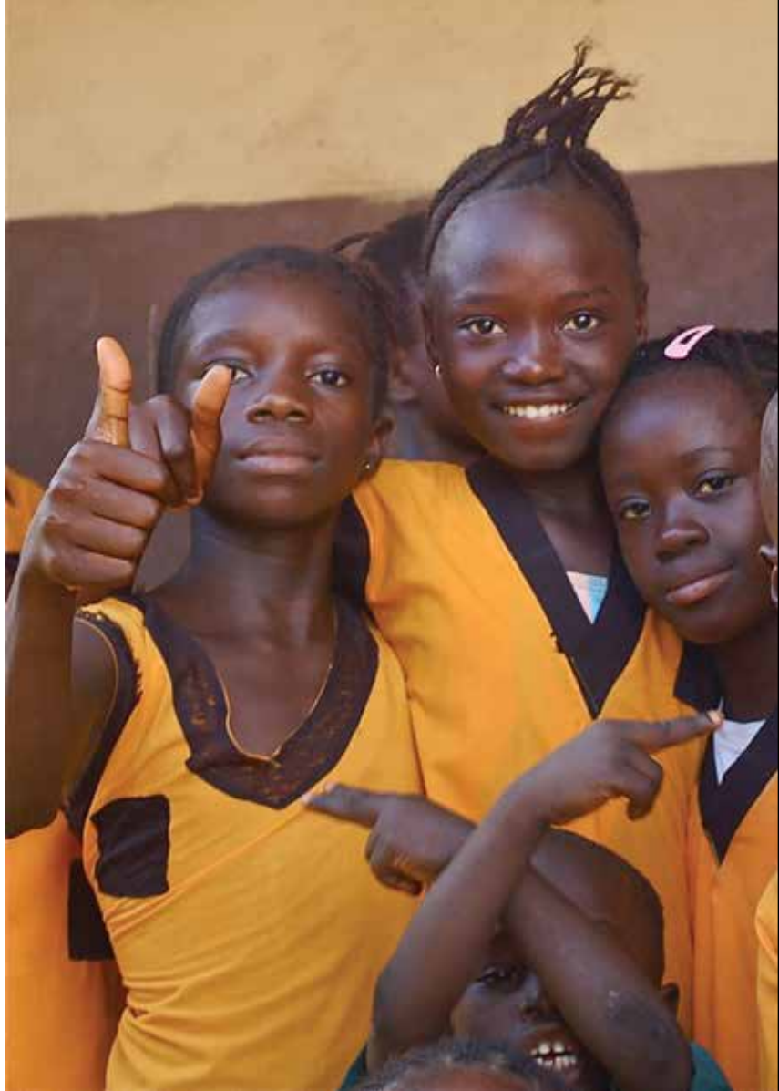
Interviews and group discussions were part of the research in urban Freetown.

Two modules from the UNICEF WASH in Schools online course were presented – ‘Introduction to WASH in Schools’ and ‘Special Topics for Girls’ [14, 15] – with additional information specific to Sierra Leone. Training on research ethics was adopted from the FHI 360 Research Ethics Training Curriculum [16], and the ethics protocols were reviewed and approved by Emory University’s Institutional Review Board and Sierra Leone’s Ministry of Education, Science and Technology.